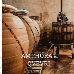
AMPHORA & QVEVRI