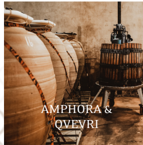
AMPHORA & QVEVRI