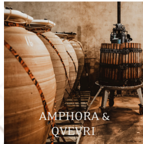
AMPHORA & QVEVRI