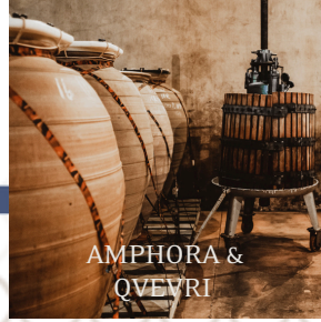
AMPHORA & QVEVRI