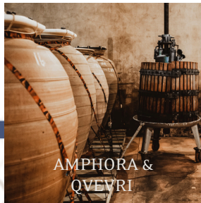
AMPHORA & QVEVRI